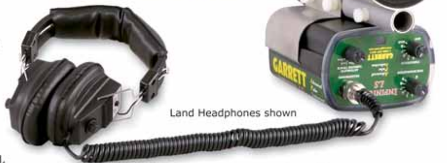
Land Headphones shown